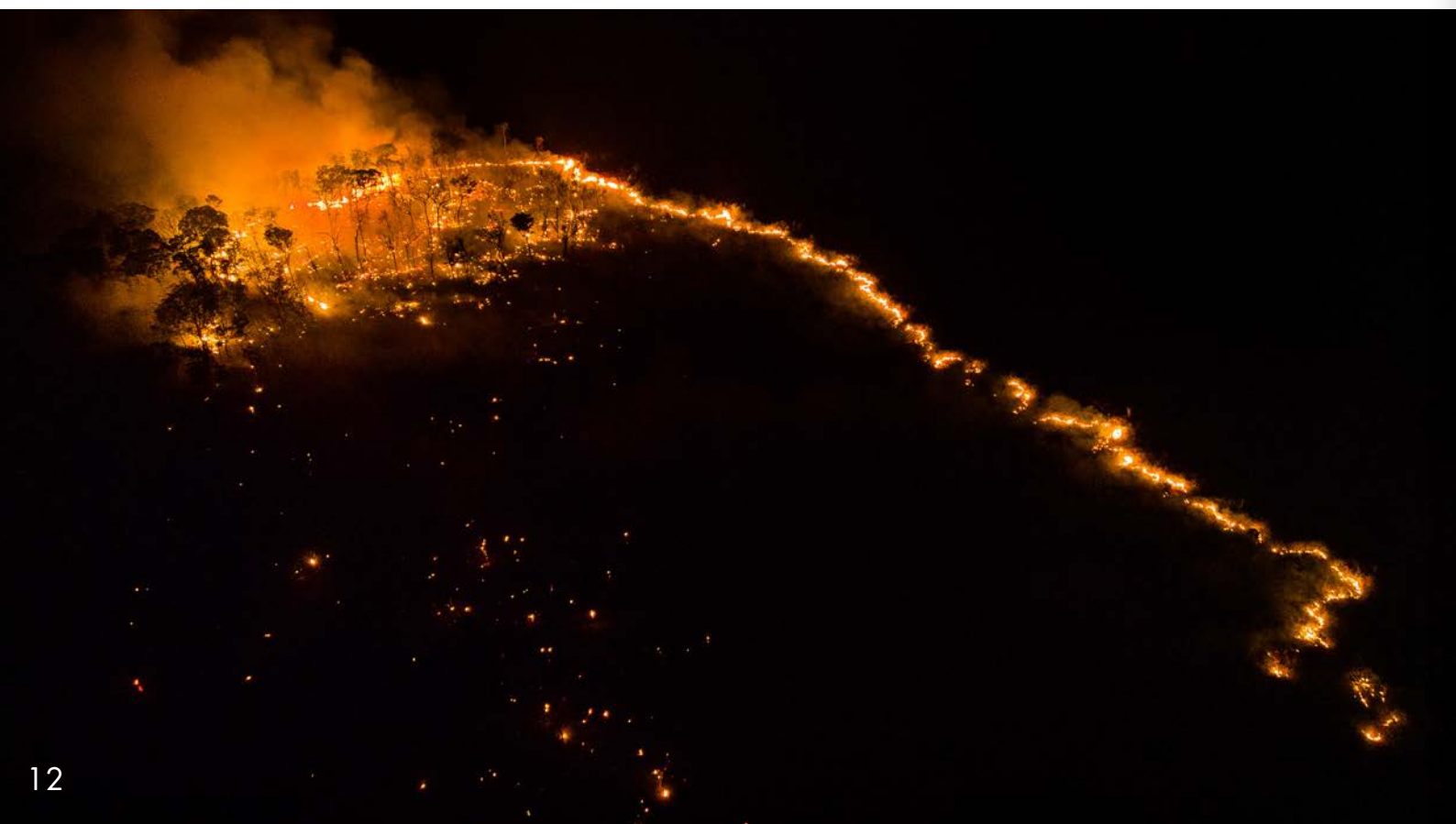
Image: Fire is used to clear land to grow animal feed crops, decimating wildlife habitat and exacerbating climate change. Fire in Nova Mutum municipality, Brasil.

And it’s not just JBS. All global factory farming giants must reduce the amount of meat they produce, and instead embrace humane and sustainable plant-based food. This is for the sake of people, animals and our climate crisis.