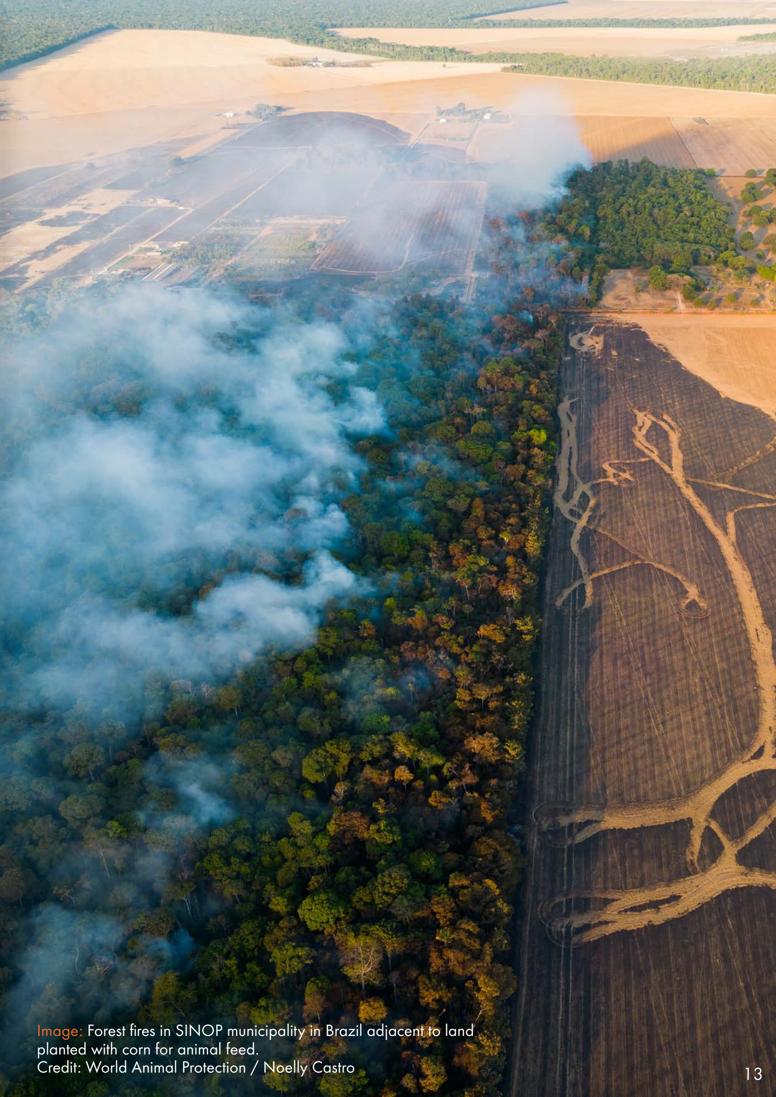
Image: Forest fires in SINOP municipality in Brazil adjacent to land planted with corn for animal feed.