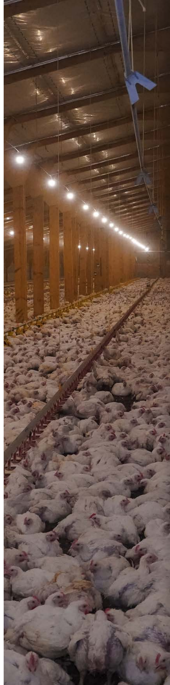
Image: A global trade in animal feed underwrites factory farmed meat production around the world. Pictured: UK farm.

World Animal Protection head of animals in farming campaign