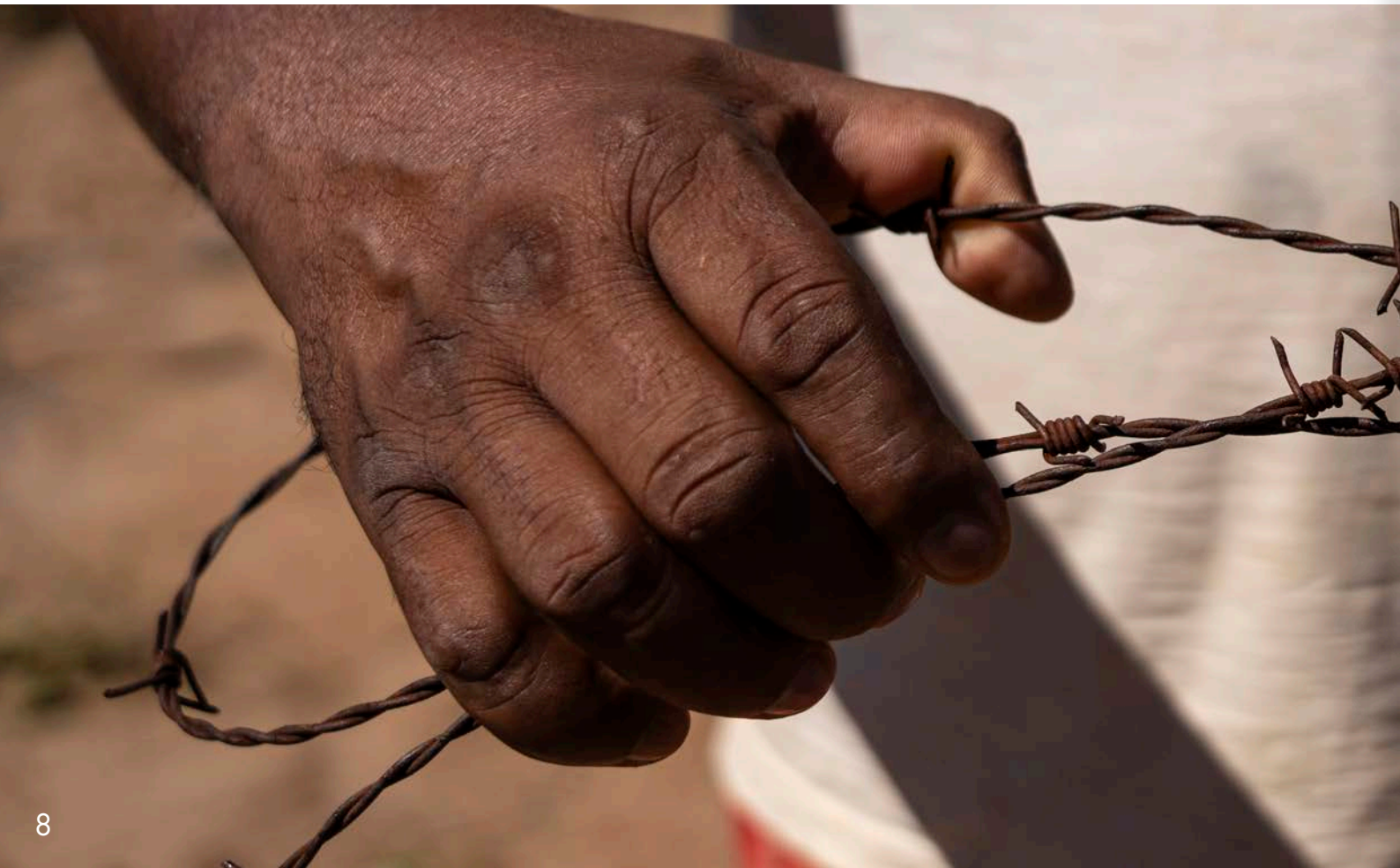
Image: A traditional small scale farmer finds his wire fence has been cut.

A new World Animal Protection investigation with Repórter Brasil, reveals JBS links with Farmer X who registered neighbouring traditional community land in the threatened Cerrado as his own. Farmer X is a powerful farmer who owns three farms in the region totaling 12,500 hectares.