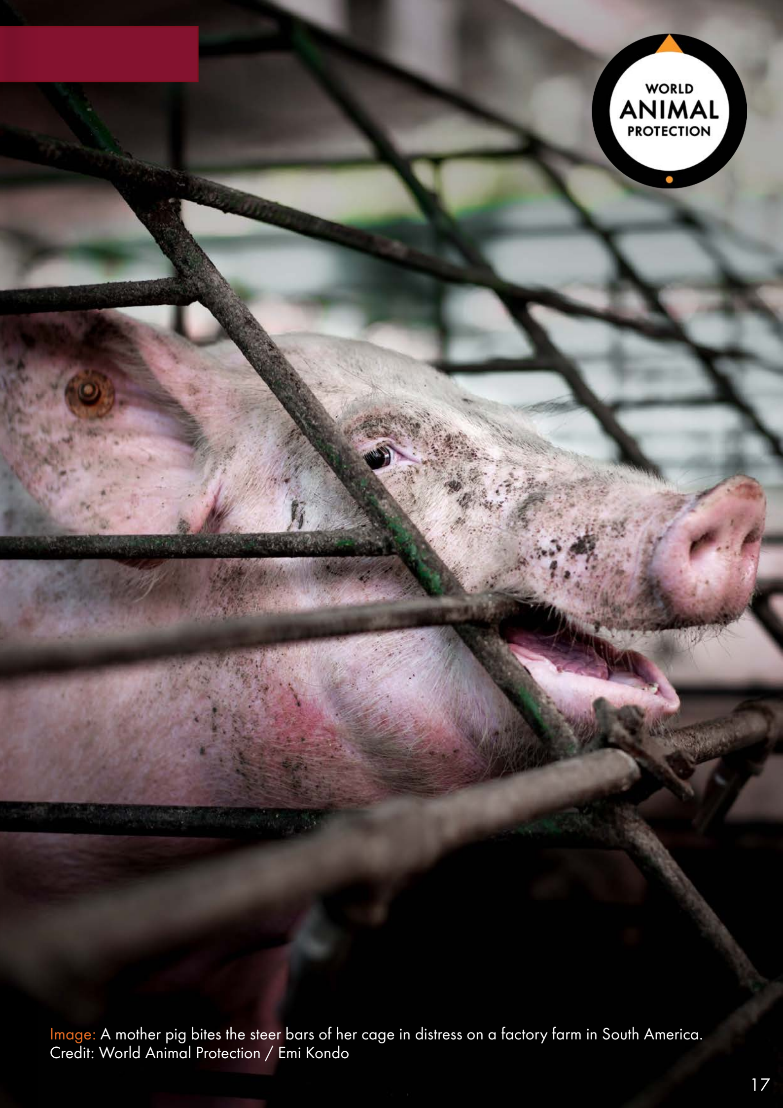
Image: A mother pig bites the steel bars of her cage in distress on a factory farm in South America.