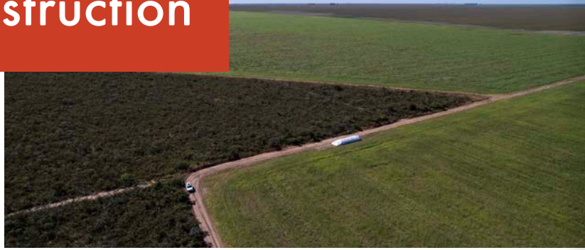
Image: Farmer Y property – Aerial view of crops planted to feed animals on factory farms.

Our second investigation with Repórter Brasil, uncovered JBS' links with 'grain laundering'. Some farmers adopt this illegal practice to profit from growing grain on prohibited land. It enables them to evade government bans designed to allow vegetation to regenerate following previous unauthorised land clearance.