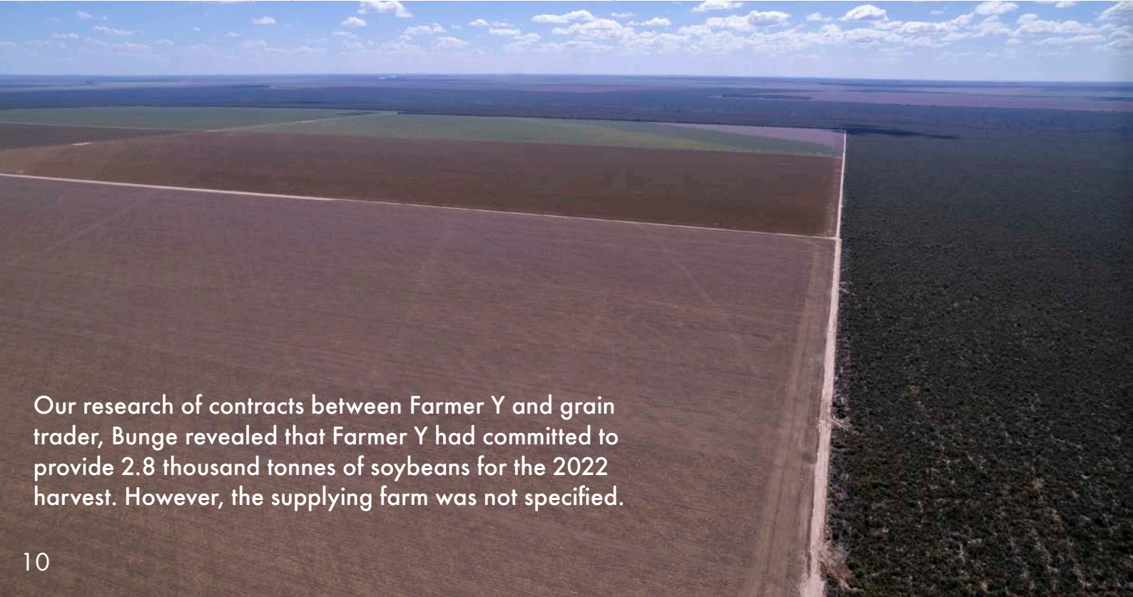
Image: Aerial view of soja crops. This land is under IBAMA (Brazil Ministry of Environment) embargo at Bahia State, Brazil.

Our research of contracts between Farmer Y and grain trader, Bunge revealed that Farmer Y had committed to provide 2.8 thousand tonnes of soybeans for the 2022 harvest. However, the supplying farm was not specified.