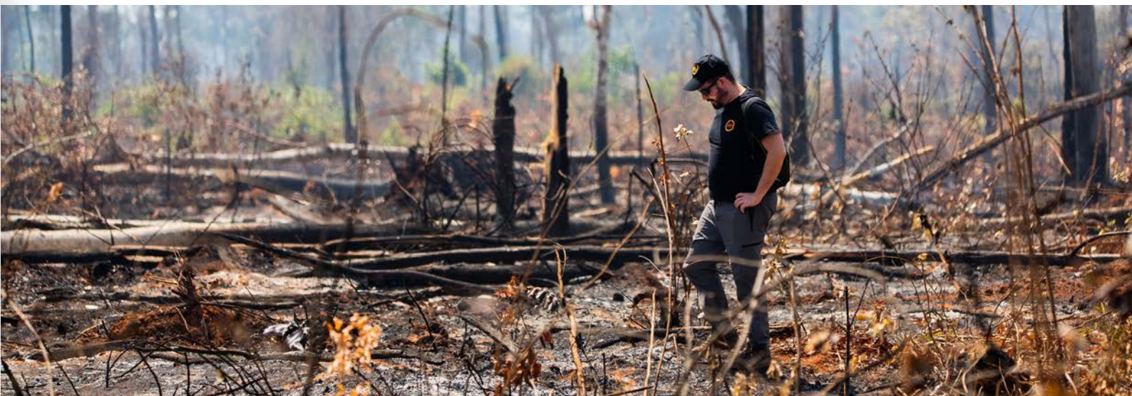
Image: World Animal Protection and local partner, GRAD, monitor the impact of fires on wildlife and help injured animals in Nova Ubirata municipality, Brazil.

And this is not only about Brazil. Factory farming continues to spread across our planet. Increased demand for meat and animal feed drives what happens on the frontlines of habitat destruction.