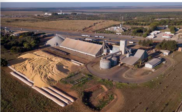
Images: Aerial view of corn silos at Tangará da Serra, Mato Grosso, Brazil

And the examination of the boundaries of the properties of farmer Y showed there was evidence of insufficient land authorised to grow grain to meet the terms of the contract. This suggests the grain must have come from elsewhere – most likely from prohibited areas – and this lack of contract specificity facilitates grain laundering.