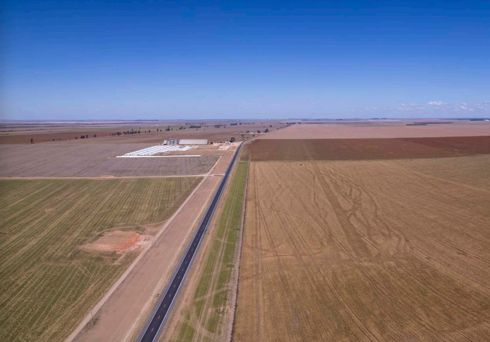
Image: Farmer X property – Crops are planted to feed animals on factory farms.

And the examination of the boundaries of the properties of farmer Y showed there was evidence of insufficient land authorised to grow grain to meet the terms of the contract. This suggests the grain must have come from elsewhere – most likely from prohibited areas – and this lack of contract specificity facilitates grain laundering.