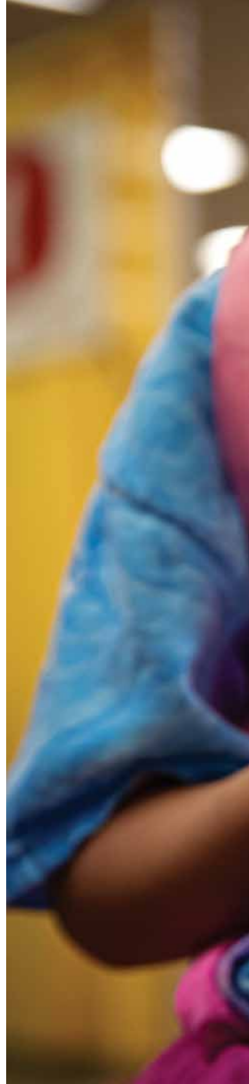
Photo right: Often billed as a good "starter" pet, it is not uncommon to see children holding and handling Ball pythons at pet expos in North America.

The result of this disconnect between claims and reality is that we are often less likely or willing to consider their well-being along all the stages of their life, from their capture to the time they are brought into someone's home as a pet. Mortality rates are difficult to determine and are subject to debate. For example, estimates for overall mortality rate of reptiles in UK homes in the first year of ownership vary between 4% 13 and 75% 14 . However, it is important to note that even a 1% mortality rate during transport alone represents millions of animals given the size and scale of the industry. 15,16