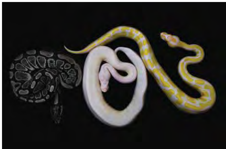
Photo above: Ball python designer morphs on display at a pet expo, Memphis, USA.

A “designer morph” Ball python is the creation of a breeder who has combined two or more “wild morphs” to create something never seen in nature. 91 Some breeders view wild-sourced Ball pythons from Africa as potentially valuable new genetic “stock” that can aid them in their efforts.