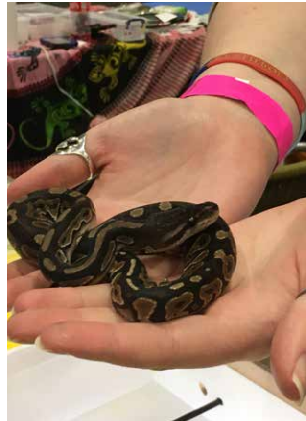
Photo top: At Doncaster reptile expo, Ball pythons are kept in small, tight containers - a welfare nightmare. Photo bottom: Ball python kept in small plastic container while on display at Doncaster reptile expo.